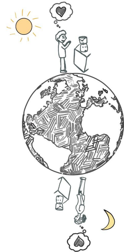
Figure 2. Interacting couples in a long-distance relationship via Yōkobo

To cater to individuals in long-distance relationships as represented in Figure 2, Yōkobo can add a 'mood exchange' feature to its motion message capabilities. This feature uses users' mood data to exchange mood profiles between different Yōkobo units, fostering communication and connection.