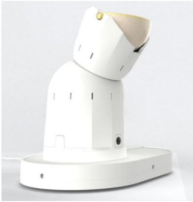
Figure 1. Yōkobo

environmental sensors, such as those for temperature or humidity, integrating this information into its behaviors.